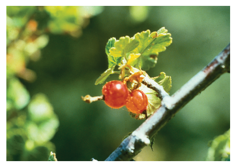
Figure 7: Wax currant (Ribes cereum)