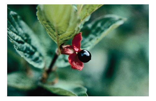
Figure 3: Twinberry fruit (Lonicera involucrata)