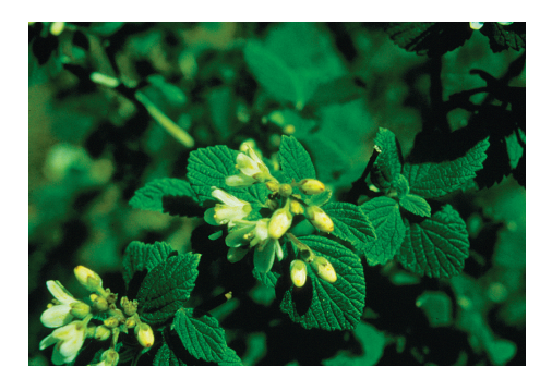
Figure 8: Waxflower (Jamesia americana)