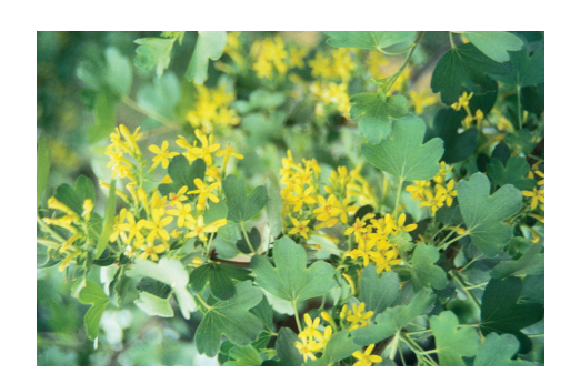
Figure 2: Golden currant (Ribes aureum)