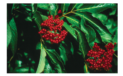
Figure 4: Red-berried elder ( Sambucus racemosa )