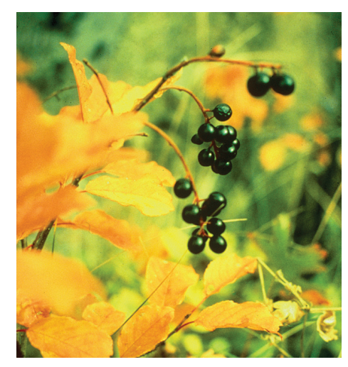
Figure 6: Western chokecherry ( Prunus virginiana melanocarpa)

Colorado. Native plant communities make Colorado visually distinct from the eastern, southern or western United States. Native plant gardens are wildlife habitats and each plant contributes to the biodiversity of the state.