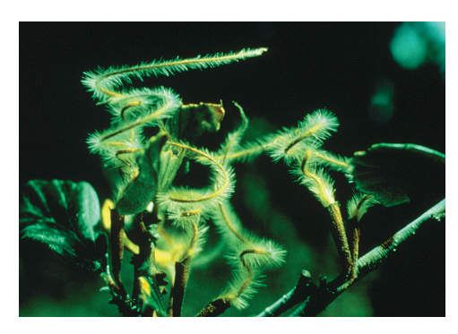
Figure 1: Mountain-mahogany fruit ( Cerocarpus montanus )