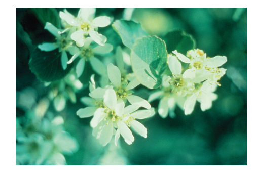
Figure 9: Serviceberry (Amelanchier alnifolia)