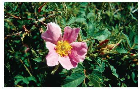
Figure 5: Wild rose (Rosa woodsii)

similar. Even if a site has a non-native landscape that requires additional inputs (such as an irrigated landscape on the plains), dry land native plants can be used in non-irrigated pockets within the non-native landscape. These native "pocket gardens" can be located in areas such as parkways and next to hardscapes that are difficult to irrigate.